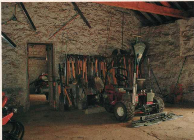
Although a new maintenance facility was built in 1984, "The Barn" is still used as a storage facility for turf equipment.