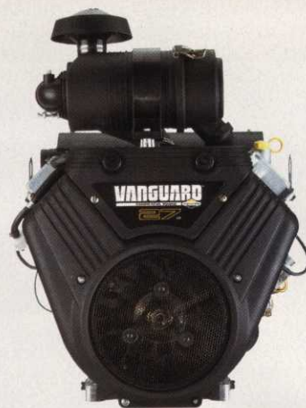
The Big Blocks deliver what the commercial market wants, says Briggs & Stratton.

debris management system that is incorporated into the engine's air-cooling system and allows the engine to run cooler and cleaner, while enhancing durability and performance. A lightweight aluminum block increases the power-to-weight ratio by reducing the overall equipment weight. In addition, a centrifugal, multistage industrial air cleaner provides engine protection.