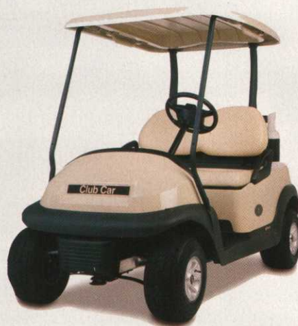
The Precedent features a rounded front cowl that makes it resemble an automobile.

Dow AgroSciences will display its new product Spotlight, a postemergent specialty herbicide for improved clover control, and control of other annual and perennial broadleaf weeds. It controls white clover, ground ivy, chickweed, black medic, dandelion, henbit, buckhorn plantain and other tough weeds. Spotlight is labeled for use on warm- and cool-season grasses.