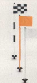
Par Aide's Jr. Flagsticks

WJ Christensen Enterprises LLC will exhibit its Underground Rake Caddie, a new way to store and retrieve bunker rakes. The rake is stored underground near the