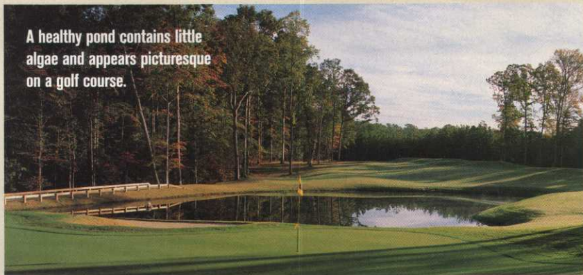
A healthy pond contains little algae and appears picturesque on a golf course.