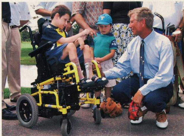
HURDZAN/FRY GOLF COURSE DESIGN

Hurdzan spearheaded forming of the chapter four years ago after learning of the organization's good works. The inter-