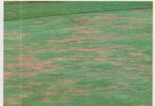
BTA grub damage consists of dead patches of coalescing turf.

BTA grubs are measurably smaller than most other white grub species. Nonetheless, these grubs can cause serious damage to short-cut turf, especially to creeping bentgrass, annual bluegrass and perennial ryegrass (Potter, 2001). BTA grubs damage the turf by feeding on living grass roots as well as decaying organic matter.