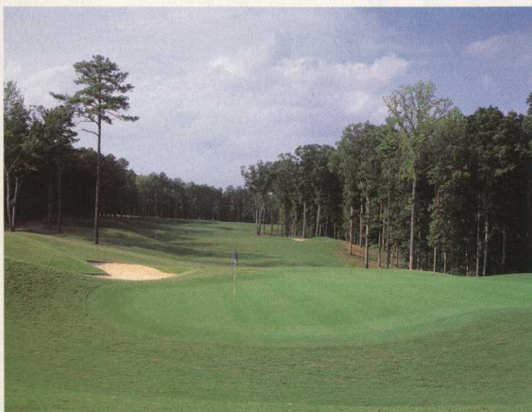
A good cultivation program for the collars is important to maintain a smooth transition from putting green to collar. Mowing practices on collars is no different than on any other part of the course.