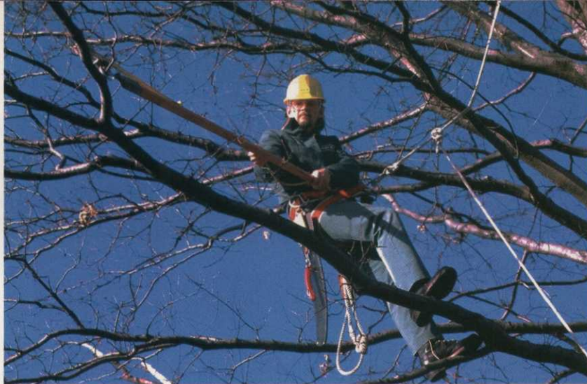
THE DAVEY TREE EXPERT CO.

Proper pruning should not be confused with the disfiguring practice of topping, which is the indiscriminate removal of a tree's main branches result-