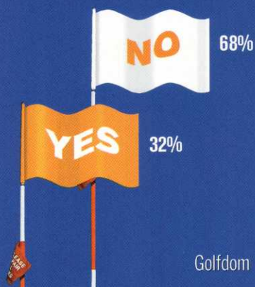
Were You Forced to Cut Your Budget Midyear Because of the Economy?