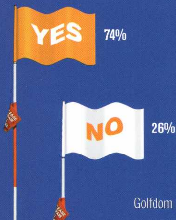
Has the Struggling Economy Affected Your Course's Revenue?