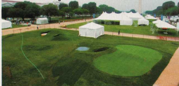
THE SMITHSONIAN INSTITUTION

To celebrate Scottish history on the National Mall, the Smithsonian built a golf hole.