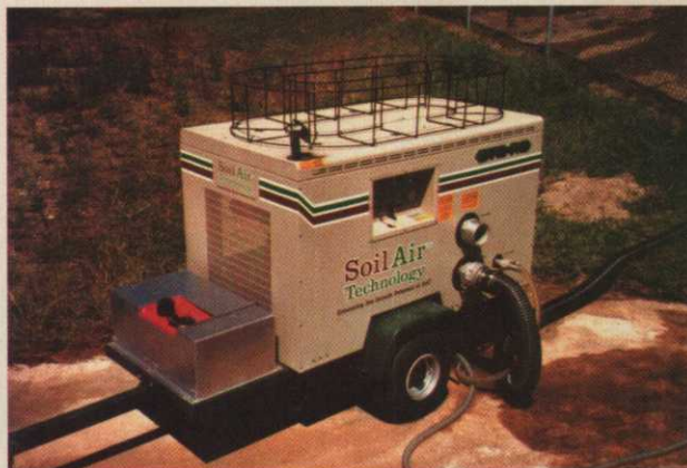
The GTS-RG portable unit is easily transferred between holes.

In the summer months, the unit is used primarily to