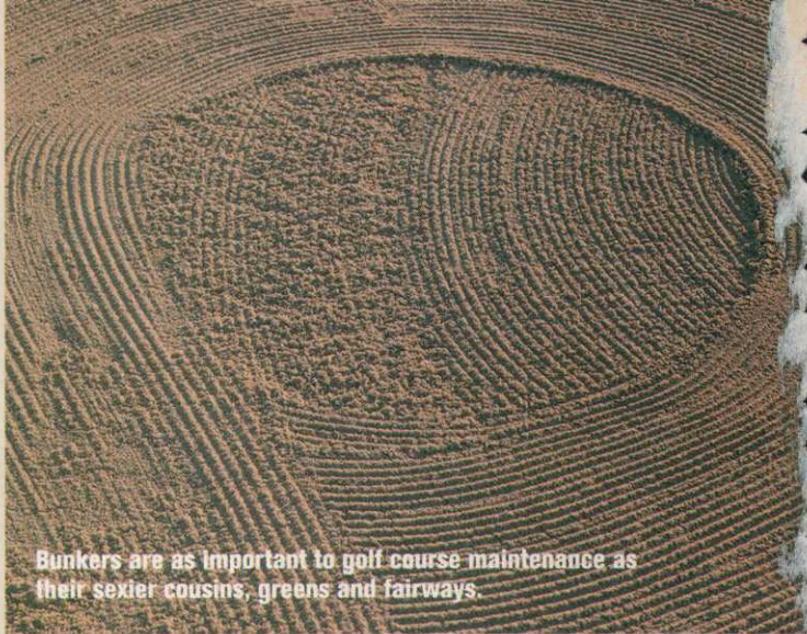
Bunkers are as important to golf course maintenance as their sexier cousins, greens and fairways.