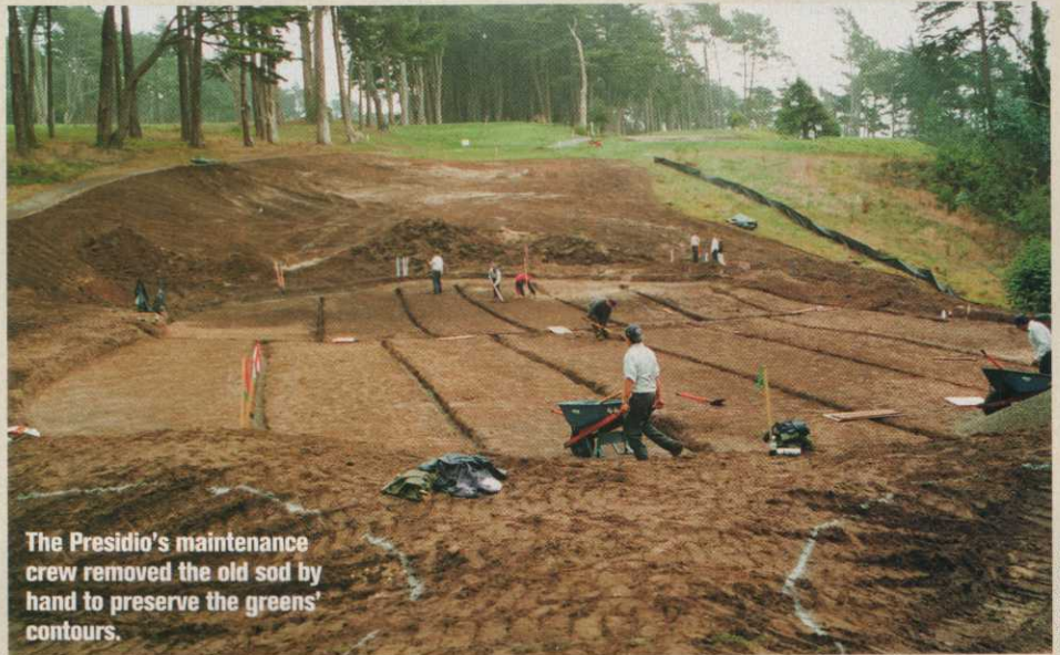
The Presidio's maintenance crew removed the old sod by hand to preserve the greens' contours.

Remove the old sod by hand and replace it with a bentgrass mixture that contained species that were nematode resistant.