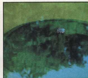
Ottershield Lake Dye