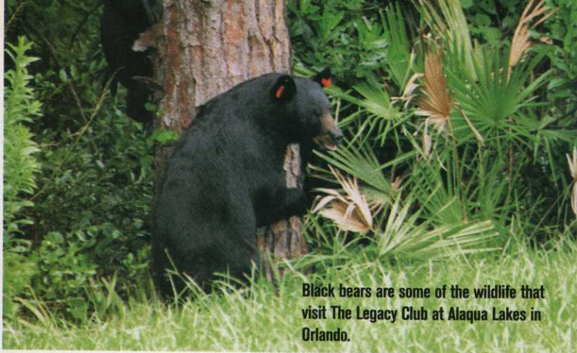
Black bears are some of the wildlife that visit The Legacy Club at Alaqua Lakes in Orlando.

“The Cooperative Sanctuary program gave us a framework from which we could defend ourselves.”