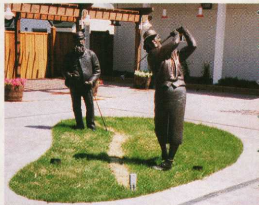
Some of the coolest art in Aurora, Colo., including these two statues, can be found at Murphy Creek CC.

found at the new Murphy Creek GC next to the clubhouse. Currently, there are two sculptures, one of Bobby Jones and the other of Babe Dedrickson Zaharias. Eventually, arts and golf officials want to erect six sculptures, depicting a "mythical foursome" of golfing greats, a notable caddie and a famous golf course architect all standing together.