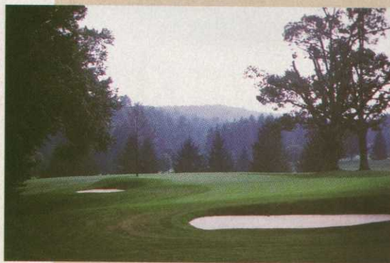
The holes at Biltmore Forest lay naturally on the rolling terrain, Silva says.