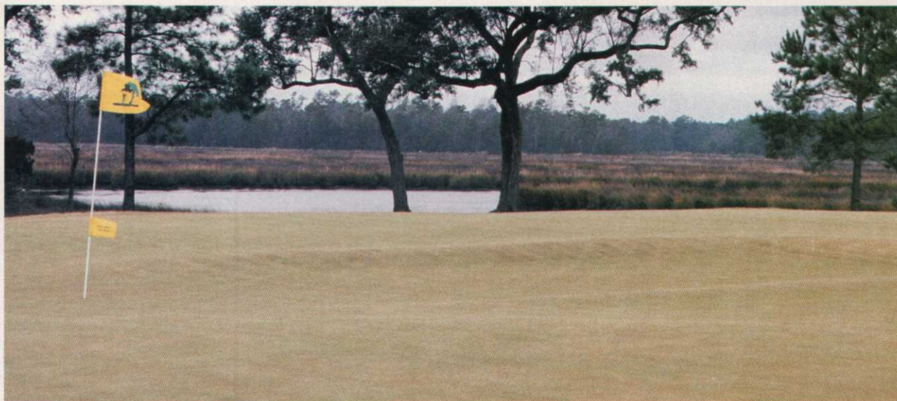
RENAISSANCE GOLF DESIGN

If you play Yeamans Hall today, you'll experience fast greens with steep contours. It's a better test of golf, but not an agonizing experience.