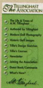
The Life & Times of A.W. Tillinghast

▶ ***** www.tillinghast.net - The Tillinghast Association wanted to create an elegant and charming site dedicated to architect A.W. Tillinghast. It succeeded. Not only does it list well-organized biographical informa-