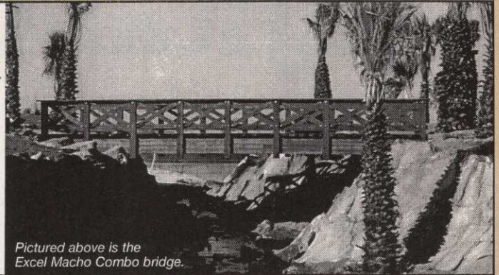
Pictured above is the Excel Macho Combo bridge.

For more information, call us at (800) 548-0054, or E-mail us at excelbdg@gte.net for your free consultation and catalog, or look us up on the web at www.excelbridge.com