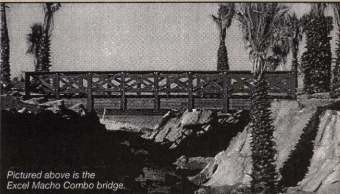
Pictured above is the Excel Macho Combo bridge.

For more information, call us at (800) 548-0054, or E-mail us at excelbdg@gte.net for your free consultation and catalog, or look us up on the web at www.excelbridge.com