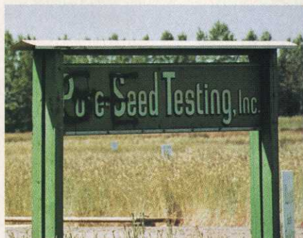
The "GE" stands for "genetically engineered" — and vandalism.

You have to hand it to Hubbard, Ore.-based Turf-Seed — the company put its best face forward at its annual field day in June despite being the victim of an eco-terrorist attack 10 days before that caused between $300,000 and $500,000 in damage.