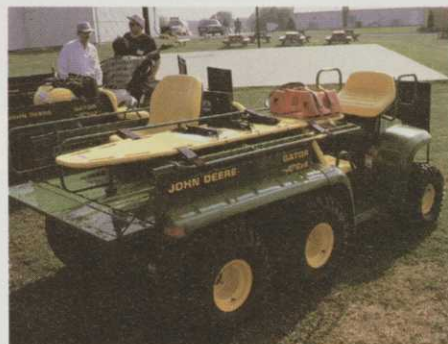
The Med-Bed turns a John Deere Gator into a mini rescue unit capable of reaching and treating a victim quickly and efficiently

The Med-Bed attachment can be installed on any Gator and easily removed. The initial assembly takes about two hours. The front passenger seat is replaced with a shorter back seat provided with the Med-Bed package.