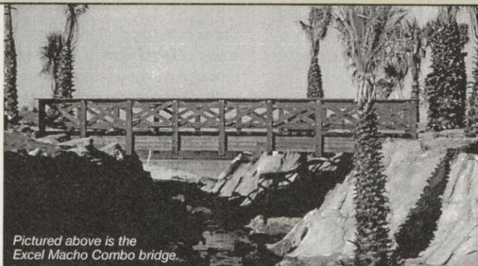
Pictured above is the Excel Macho Combo bridge.

For more information, call us at (800) 548-0054, or E-mail us at excelbdg@gte.net for your free consultation and catalog, or look us up on the web at www.excelbridge.com