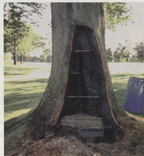
Once the rods were in place, a protective covering was used to line the inside of the tree.

tional support for the cavity. When the rods were in place, a protective covering was used to line the inside of the tree.