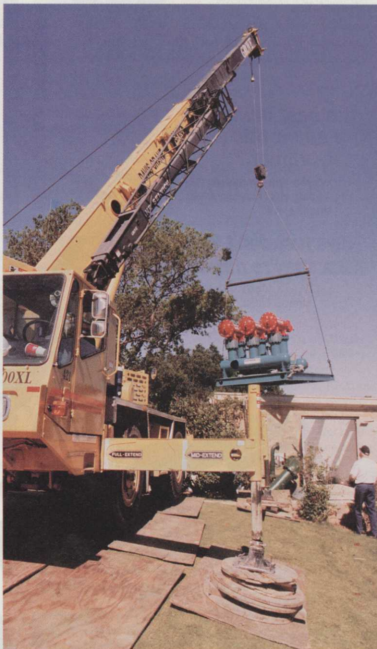
A crane, resting on the plywood road constructed to protect the landscape at Las Colinas Tournament Players Club, lowers the Flowtronex PSI pumping system in through the top of the existing pump house.

Scott Miller, Four Seasons resort director of golf and landscape operations, said: "We evaluated our old system and found that we needed to replace the old pump station. The logical