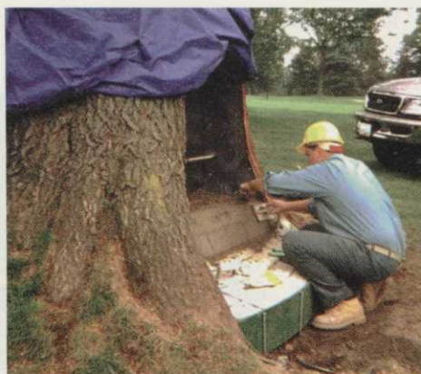
After the covering was in place, a worker began to fill the cavity with a specially mixed Portland concrete to serve as a surface for the tree's callus to grow over.

The cavity took about six days to fill and cost about $4,500, but only about