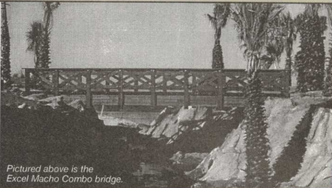
Pictured above is the Excel Macho Combo bridge.

For more information, call us at (800) 548-0054, or E-mail us at excelbdg@gte.net for your free consultation and catalog, or look us up on the web at www.excelbridge.com