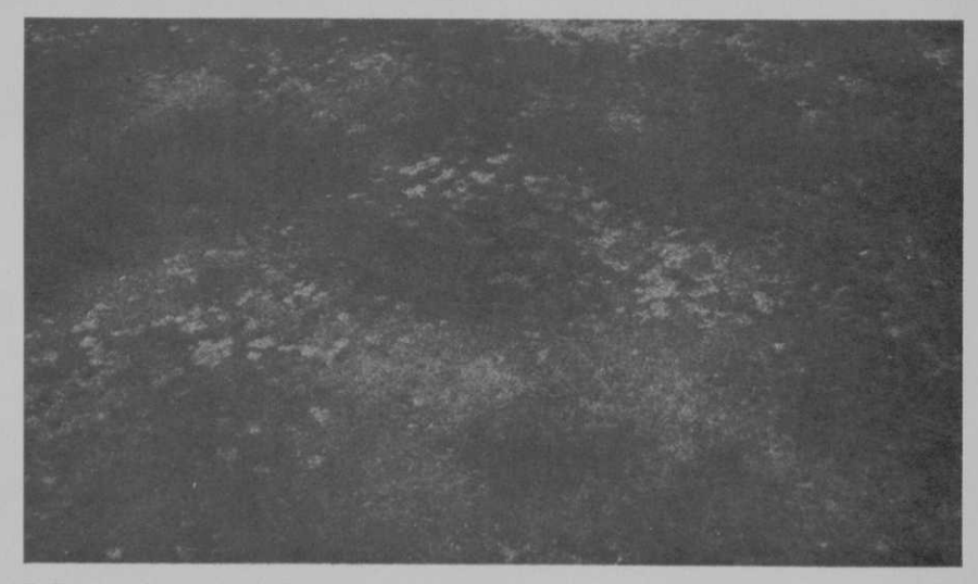
Dollar spot is showing in the dry-soil areas of this turf.

Bermudagrass located on the south slope (left) appears very healthy, while that on the north slope (right) has suffered some damage.