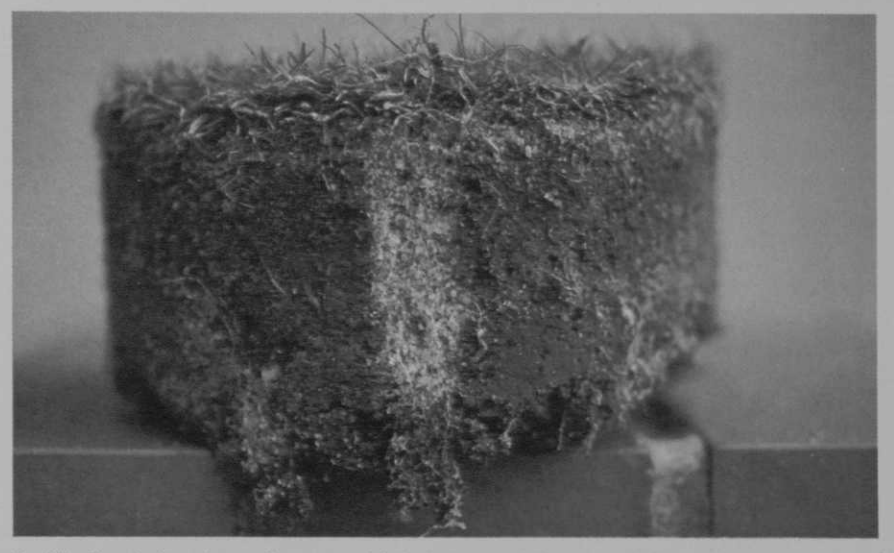
Aerification holes shown above, provide better water drainage and allow oxygen to the roots when filled with sand.