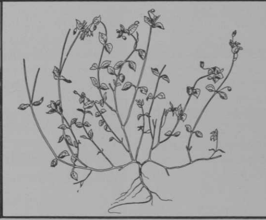
Winter weed/p. 14