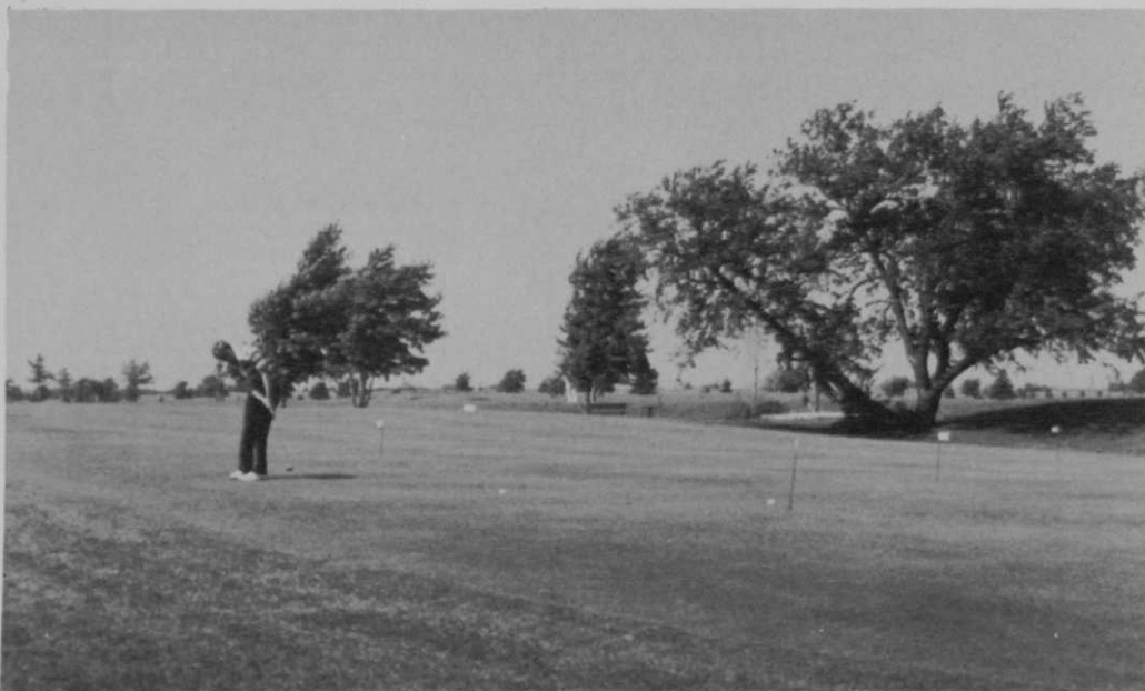
Technology was not available two decades ago to build greens to withstand a high level of traffic without becoming compacted.

Cut away the many layers of detail that make up the rich texture of any golf course and the men responsible for it, and in the consistently successful operation you will find a steadfast will to succeed. The unavoidable setbacks are not overwhelming. Unanticipated problems are recognized for what they are, as additional factors to be fitted into the overall equation. Problems become debilitating only in propor-