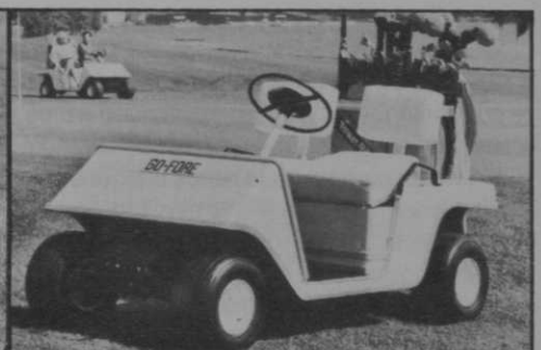
ELMCO INC. GO-FORE INC.