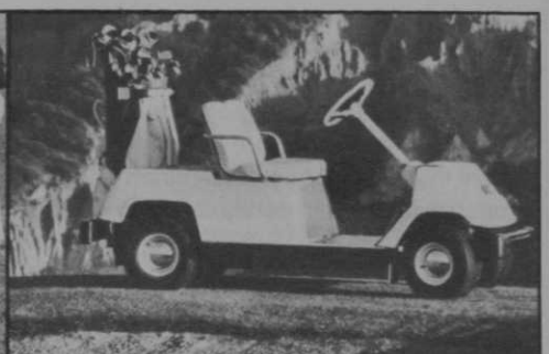
TAYLOR DUNN TEE-BIRD GT370 YAMAHA MOTOR CORP., U.S.A.

Y=yellow, G=green, B=blue, R=red, S=silver