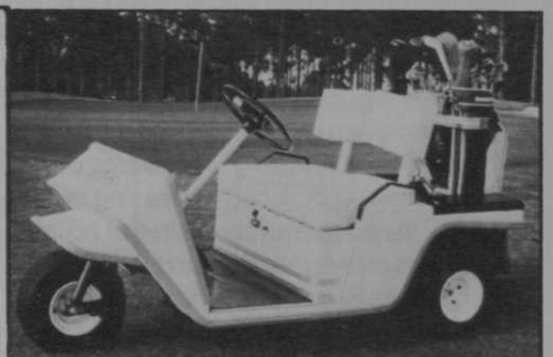
LAHER MG 470 MELEX 112