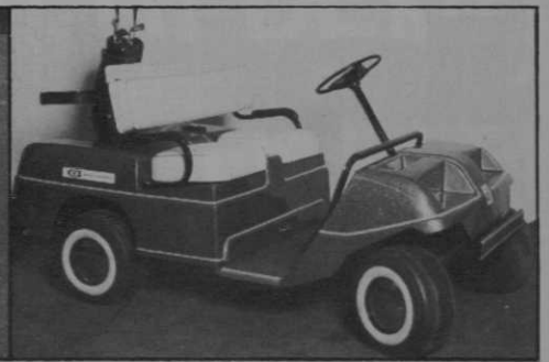
AMF HARLEY-DAVIDSON MASTER GLIDE IV AMERICAN CONTINENTAL INC.