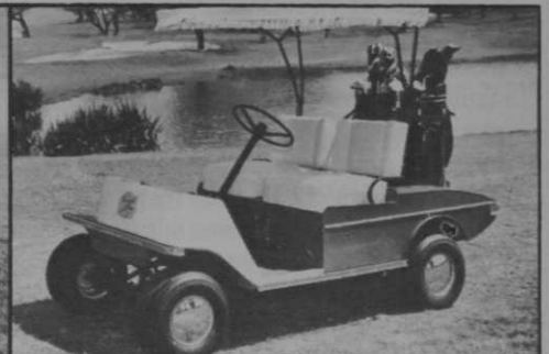
E-Z-GO ELECTRIC CARRIER CORP.