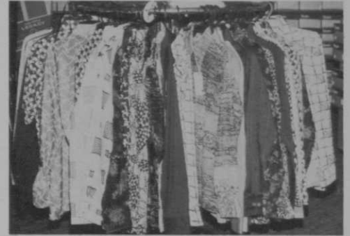
Pros will learn more about merchandising at the PGA seminar for private facility pros March 13-17 in Westchester, N.Y.