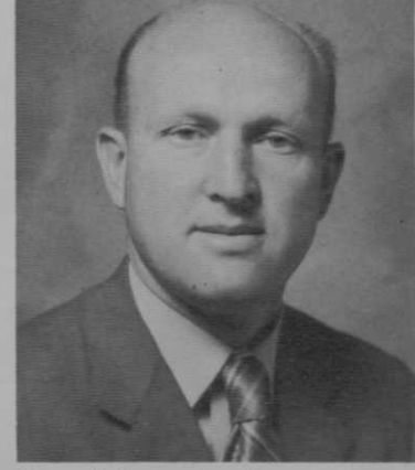
Cassell: to head golf group

Jim Hansberger told GOLF BUSINESS that the vacuum impregnation of polymer increases the strength and density of the head while maintaining the feel and appearance of natural persimmon wood.