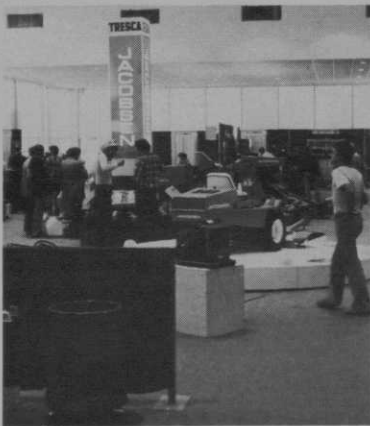
Equipment exhibits in Orlando

A broad and varied program of educational seminars and an exhibit area filled with 86 suppliers of seed, chemicals, and equipment drew 750 golf course superintendents and other turf managers to the 26th annual conference and show of the Florida Turf-Grass Association in Orlando recently.