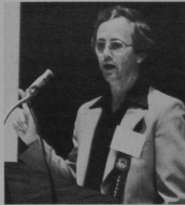
Lipsey: new era for EPA

superintendents covered use of effluent water for irrigation, use of the white amur fish for aquatic weed control, budgeting, worker/supervisor relationships, and irrigation.