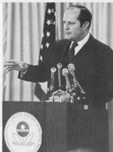
EPA Administrator Costle

After graduation, he went to work for the Justice Department in its Civil Rights Division, until 1965. He then went with the Economic Development Administration in the