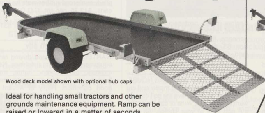
Wood deck model shown with optional hub caps

Ideal for handling small tractors and other grounds maintenance equipment. Ramp can be raised or lowered in a matter of seconds.