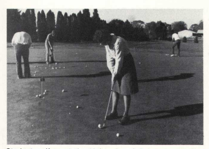
Student golfers at the University of Delaware practiceputting on a golf course built by the Delaware Agricultural Experiment Station scientists. Though the course looks normal, the ground beneath is a maze of wires, pipes, tubes and soil types.