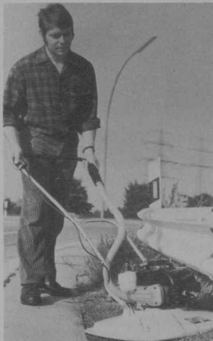
Circle No. 712 on Reader Service Card

ROTARY, AIR-CUSHION action is the trademark of the Flymo Lawnmower, now available to the American golf industry. The British product is lightweight and is especially designed to cut problem turf spots at golf courses. Highly maneuverable, the Flymo has no wheels and can reach the tough areas around traps, benches, bushes, water hazards and rough. The machine incorporates an impeller which floats the cutting blade on a pre-set height from one-half inch to two and one-half inches. A cyclac hood completely covers the cutting blade.