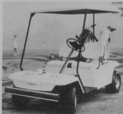
Circle No. 704 on Reader Service Card

PERFORMANCE ORIENTED is the watchword for Harley-Davidson's new DE-40 golf car. The result of unique engineering and design innovations, the car offers improved efficiency at a competitive price. Powered by a two-horsepower electric motor, the DE-40 utilizes an all-weather, fiberglass body. The car, which weighs 900 pounds, can handle a 750-pound payload, speeds up to 11 mph and takes a 50 percent grade in stride. Additional conveniences include built-in beverage holders, two large wells for miscellaneous take-alongs and a handy score-card holder.