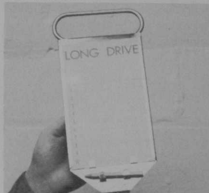
Circle No. 716 on Reader Service Card

SIMPLIFYING THE JOB of the pro for those long drive and proximity prizes on tournaments days, the Pro Aids Marker is the answer. For years, the pro got by with makeshift markers for guest-member get-togethers, but the Pro Aids Marker is made of sturdy metal and is weather resistant. The marker set includes 50 handy cards for easy record keeping. Sets of four complete the package. Extra stock cards are also available.