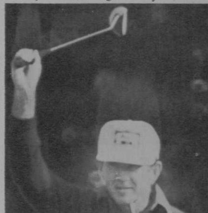
Circle No. 714 on Reader Service Card

sweet spot. Lining up putts is aided by 11 marks spaced on the top of the head, as the golfer looks down. The head is made of a composite of metals, including zinc, magnesium and copper. Below Gene Littler holds his Zebra putter, which assisted in his victory in the Bing Crosby.