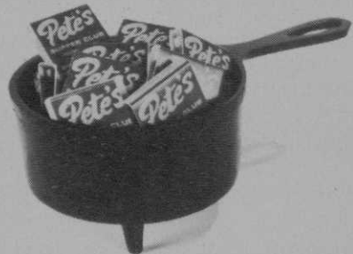
Circle No. 709 on Reader Service Card

PRACTICAL CENTERPIECE containers that accent the past can now highlight clubhouse tables, as George Koch Sons, Inc., markets its new Grandma's Kettle table collection. These memorable miniatures suggestive of the "Spirit of '76", are made of cast aluminum and are enameled in a variety of colors. The containers can be utilized for holding packaged cream, individual mustards and ketchups.