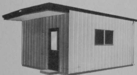
Circle No. 702 on Reader Service Card

DESIGNED TO meet the space requirements of golf courses, the Panlframe II mini building, is the latest structural innovation from the Butler Manufacturing Company. The buildings are available in lengths of 20' and 25' and widths of 10', 15' and 20'. Easy to erect, the structure is composed of as few components and parts as possible. The Panlframe is ideal for tool or machinery shelters.