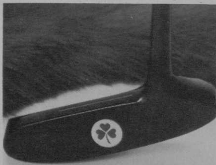
Circle No. 710 on Reader Service Card

ALL ONE piece and totally graphite, the Luv-It Putter by Shamrock Golf enables the golfer to hit the ball practically anywhere on the blade and produce a solid hit. The Luv-It makes putting simpler, due to its distribution of lead in the head. Functional and at the same time good looking, the putter is made of translucent, emerald green graphite with a standard length of 34 inches. A emerald, genuine rabbit putter cover is included with each piece.