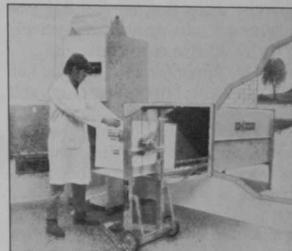
Circle No. 105 on Reader Service Card

THE TONY TEAM, INC., introduces Pollution Packer Thru-the-Wall Storage Chutes that can be installed or designed into clubhouses for use with Pollution Packer inside waste and refuse compactors. According to the company, storage of compacted waste allows the equivalent of up to 10 times greater volume than loose waste; reduces frequency of pickup by haulers from 50 to 80 per cent and eliminates multiple waste storage containers. Modules can be hidden by decorative shrubbery or fences. Available in 6, 12, 18, and 24-foot lengths.