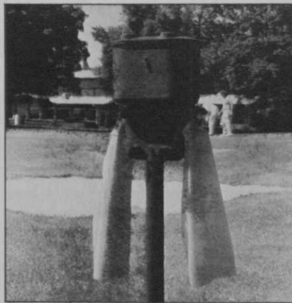
Circle No. 103 on Reader Service Card

THE KENDALL COMPANY, manufacturers of Pro-Tee disposable golf towels, are now making a green on white print as well as their gold pattern. Towels are made of heavy-duty, non-woven rayon fabric, textured to add to their tear-resistance and absorbency; dry quickly, resist mildew and stand up well in all kinds of weather; are crisper and more attractive than cotton towels, according to the company. Heavy rust-resistant grommet inserted in the doubled-over center fold makes towels easy to attach to ball washer, bag or cart. Towels measure 14 inches by 24 inches and come packed in cases of 200.