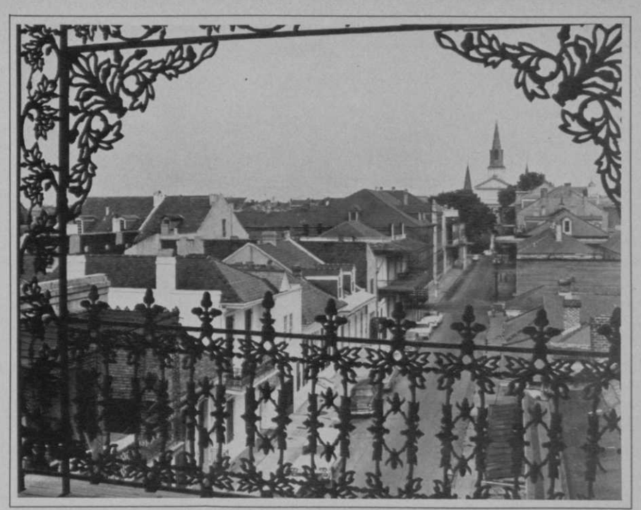
Lacey iron scrollwork adorns many of the buildings in the Quarter.