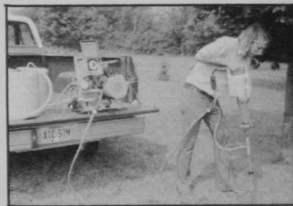
Circle No. 705 on Reader Service Card

fertilizer up to 18 inches deep into the root zone in as little as 10 seconds. The one-man operation is portable and, above all, accurate. The impact hammer weighs only 15 pounds but packs a 5,000 pound wallop. Once the probe is inserted, the operator presses a button and a precise amount of fertilizer is forced automatically into the root zone area.