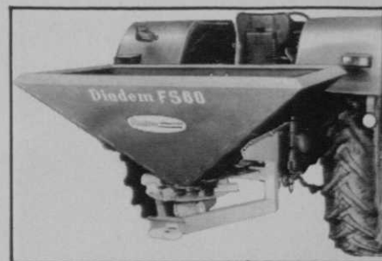
Circle No. 706 on Reader Service Card

DIADEM FS-60 , Vandermolten Corporation's newest "super spreader," the firm says, uses less time than required with conventional 3-point hitch spreaders. The FS-60 holds up to 1,500 pounds of fertilizer and is capable of a 100-foot swath width. It features low height for fast loading and rugged construction with sealed gearbox drive. The spreader's finish, a special anti-corrosive epoxy lamination, provides protection from rust and corrosion and allows simple hosing down with water when cleaning.