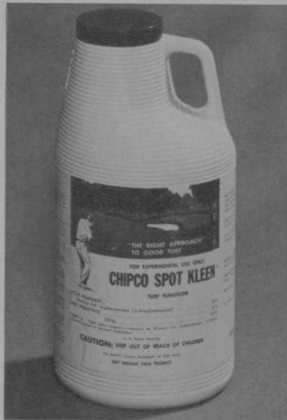
Circle No. 105 on reader service card

CHIPMAN, Div. of Rodia, Inc., announces EPA clearance of Chipco Spot Kleen for use as a turf fungicide. Spot Kleen is a long residual, nonmercurial, systemic fungicide for control of dollar spot, fusarium blight, large brown patch and stripe smut. A wettable powder, it is uniquely packaged in a plastic jug for easier handling. Spot Kleen is an addition to the Chipco line of professional turf products.