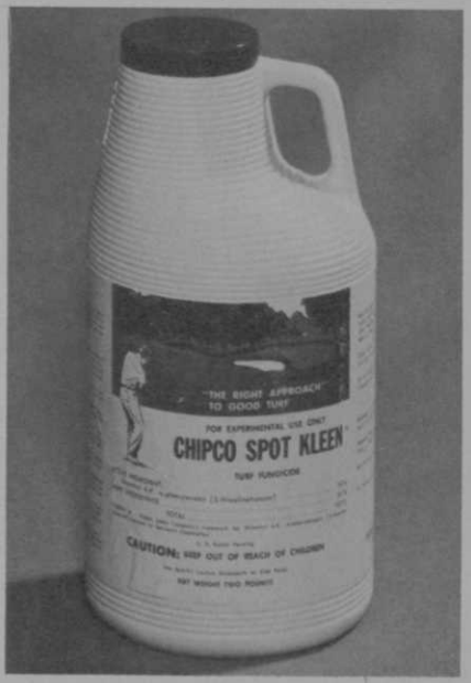
Circle No. 105 on reader service card

CHIPMAN, Div. of Rodia, Inc., announces EPA clearance of Chipco Spot Kleen for use as a turf fungicide. Spot Kleen is a long residual. nonmercurial, systemic fungicide for control of dollar spot, fusarium blight, large brown patch and stripe smut. A wettable powder, it is uniquely packaged in a plastic jug for easier handling. Spot Kleen is an addition to the Chipco line of professional turf products.