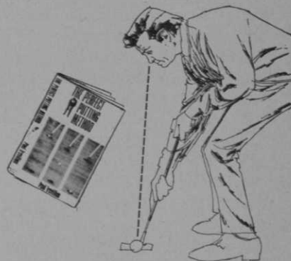
Circle No. 257 on reader service card.

TREVILLION GOLF PRODUCTS has been formed to bring American golfers the developments of Britain's Paul Trevillion—"The World's Greatest Putter." A full range of models of Trevillion's Pencil Putter now is available to pro shops. Every club has been designed in accordance with the principles outlined in the "Perfect Putting Method." Trevillion's best-selling book is also offered for pro shop sale.