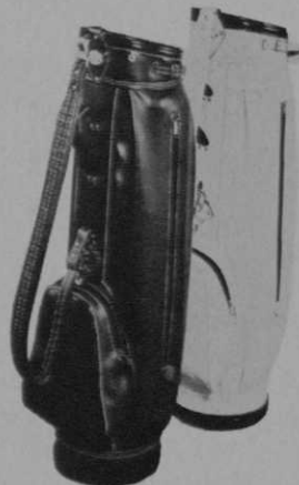
Circle No. 255 on reader service card

RAM GOLF CORP. has added two new golf bags to its 1974-75 catalog line that company officials say will be certain to become the fastest moving golf bags ever offered. The Traveler is good for the traveling golfer because of its compact design and lightweight construction. It is offered in a choice of blue or white models and comes with travel hood.