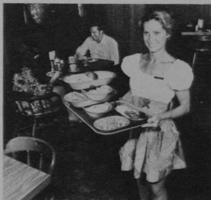
Circle No. 254 on reader service card

sanitary: seamless molding eliminates germ catching corners and food acids. Salts and detergents cannot harm interior finish.