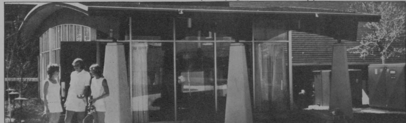
Tennis at Heather Ridge is inexpensive and popular, and players are well served by this attractive shop.

"We've created a place for you here that's unlike any other country club in Colorado. Heather Ridge has been built on the basic premise that trees are prettier than cars; that grass is nicer than pavement; that a good time is always twice as good when it happens in beautiful surroundings. . . . Add the sheer physical exhilaration of a hardwon game of golf or tennis or a sun soaked afternoon of relaxation . . . and you'll know what makes Heather Ridge a very extraordinary place indeed."