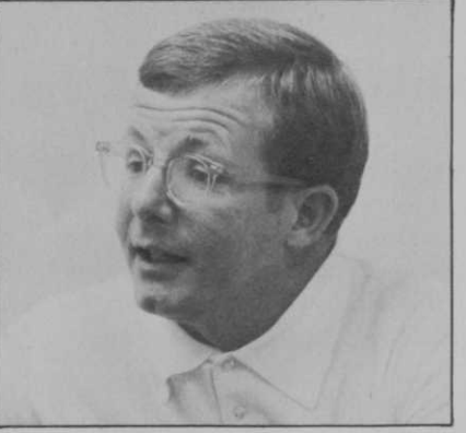
"The ultra-rich member is not . . . the best revenue producing member."

SPORTS EDITOR GREENVILLE NEWS, GREENVILLE, S.C.