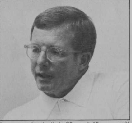
". . . couples in their 30s and 40s . . . will use these facilities the most."