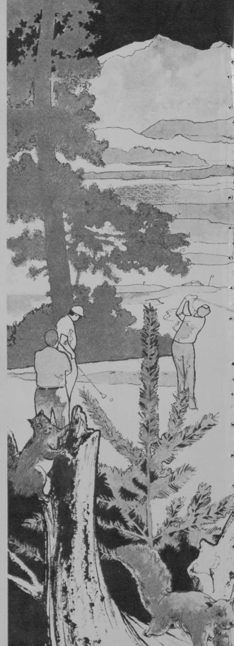
ILLUSTRATION BY LIAN ROBERTS

Skyrocketing land prices in the more desirable areas of the country have severely limited the recent expansion of golf facilities not connected with some other type of development. Though it may sound too good to be true, and despite the several qualifications that bear heavily on its accomplishment, it has been possible since 1897 to lease Federal land for golf course development. That there are only eight cases of private parties leasing Federal ground for this purpose might lead one to conclude that the process is too difficult, that too many obstacles must be hurdled, else many more instances of this highly desirable arrangement would attest to its possibility. We urge the reader not to be dissuaded. We submit that so few have availed themselves of this alternative to buying land because only a few investors are familiar with the ABC's of the Federal use permit and that, until recently, the United States Forest Service, the Federal agency empowered to dispense these permits, had not considered the golf course to be congruent with forest oriented recreational activities. This attitude was based on the fact that the majority of national forest land is unsuitable for golf courses due to heavy tree