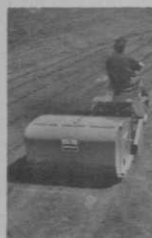
Big, soft 6.50 x 8 turf tires.