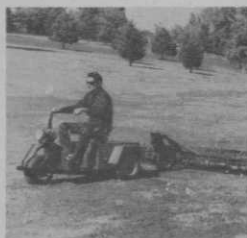
Hauling a 3-gang ball picker.