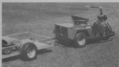
Easily tow up to 250 lbs. of tools, chemicals, spikers, trash containers, and other equipment. Low-cost low-bed utility trailer with big 35" x 66" bed available as optional equipment.