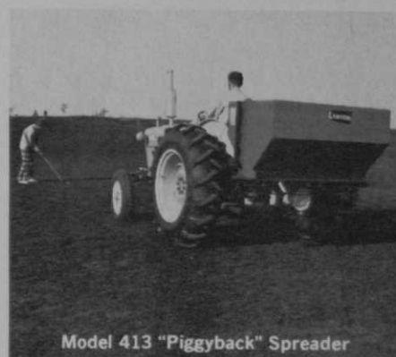
Model 413 "Piggyback" Spreader

from LIQUID Sprayer to DRY Spreader with LARSON E-Z 3-Point Hitch Equipment