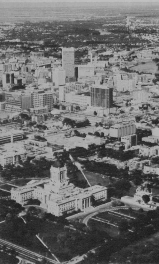
Aerial view of the city of Winnipeg, the capital of the province of Manitoba. Population is 557,000.

The park has 375 campsites at four locations, the main one in the townsite. Costs are $1.50 for unserviced sites and $2.50 for sites with water. There are good accommodations at the Kootenai Motel, Bayshore Motel, Crandell Lodge Motel, Emerald Bay Motel, Kilmorey Motor Lodge, Lakeshore Chalets, Ponderosa Motel, Stanley Hotel and Cottages, Waterton Auto Bungalows and Wildflower Motel. Rates run from $5 single to $30 per day (suite) for four. The season gen-