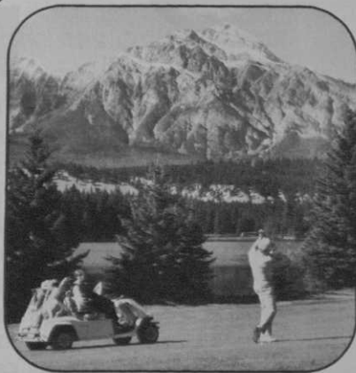
At Jasper Park Lodge every hole is lined up with a mountain peak.

In Yellowknife, in the Northwest Territories, there is the Midnight Golf Tournament in which participants play the first nine before midnight, partake of refreshments until 2 A.M. and then play the second nine—finishing about 6 or 7 A.M. □