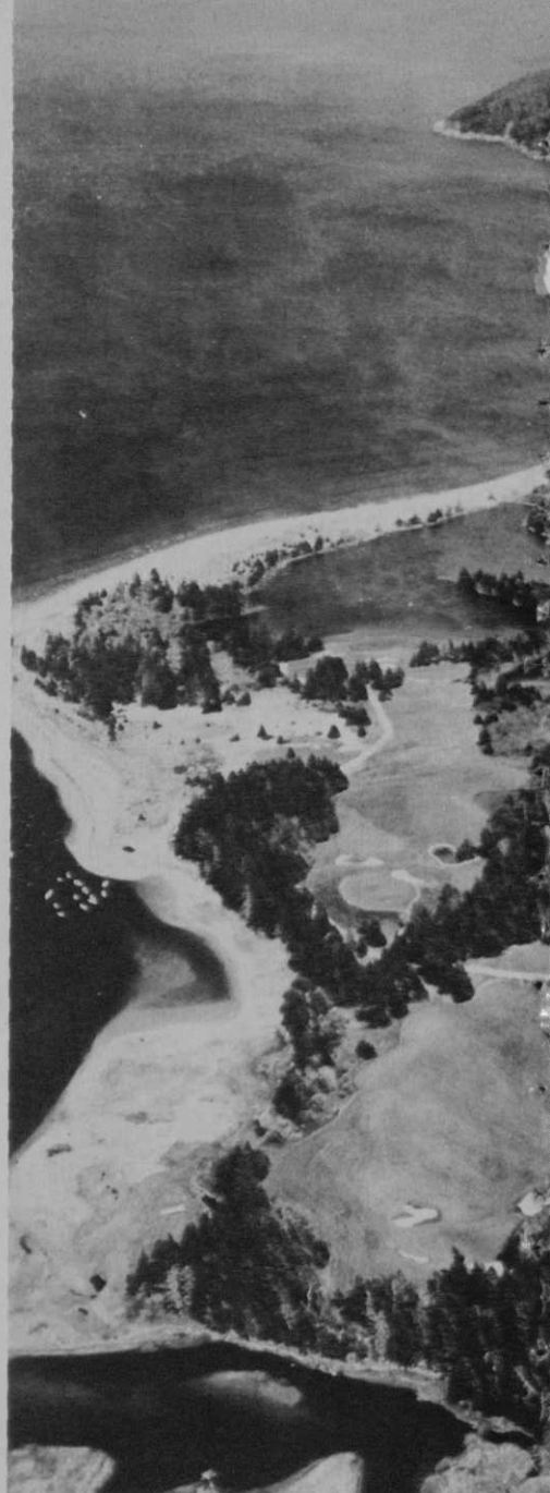
Preceding page: top, Jasper Park GC, Alberta; in "leaf," Le Manoir Richelieu, Quebec. Above: Keltic GC, Cape Breton Highlands National Park, Nova Scotia.

OAKFIELD: At 6,975 yards (par-72), one of the outstanding tests in the province. Situated on Grand and Fish