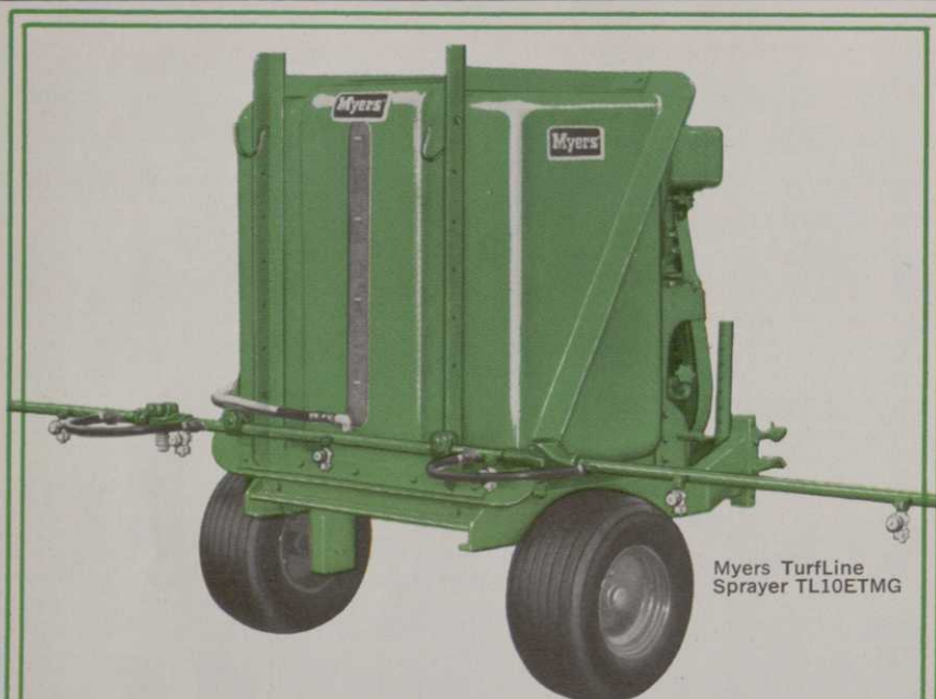
Myers TurfLine Sprayer TL10ETMG