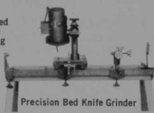
Precision Bed Knife Grinder