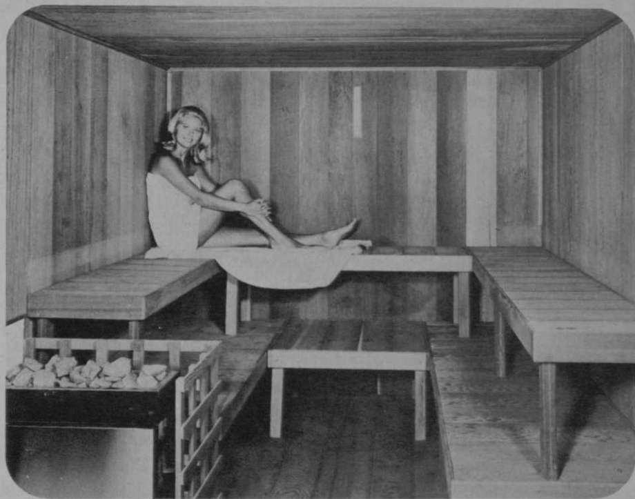
Am-Finn model, above, seats 15 people. Sauna exterior, below, matches redwood interior or adjacent walls (MacLevy Products). Viking model, opposite, is pre-built; assembly time is under an hour.

An 8-foot by 10-foot by 7-foot sauna room generally consumes